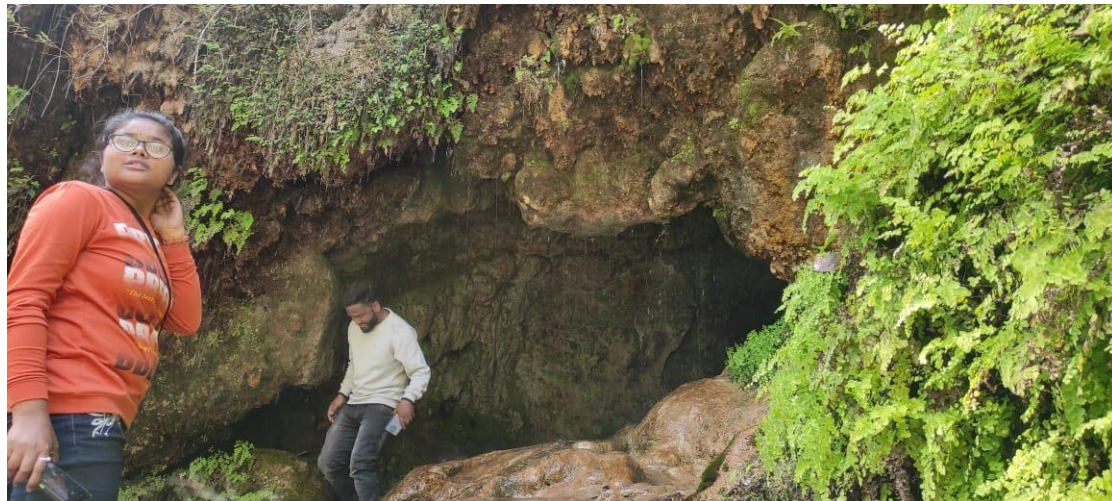
Dron Cave (Sahastradhara)