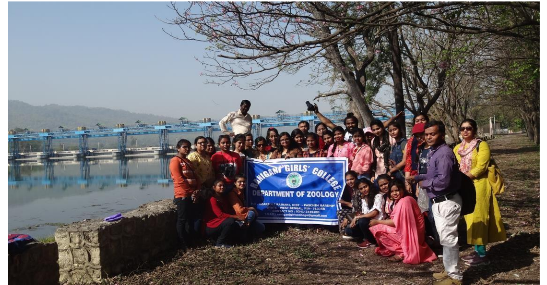
At Asan Barrage