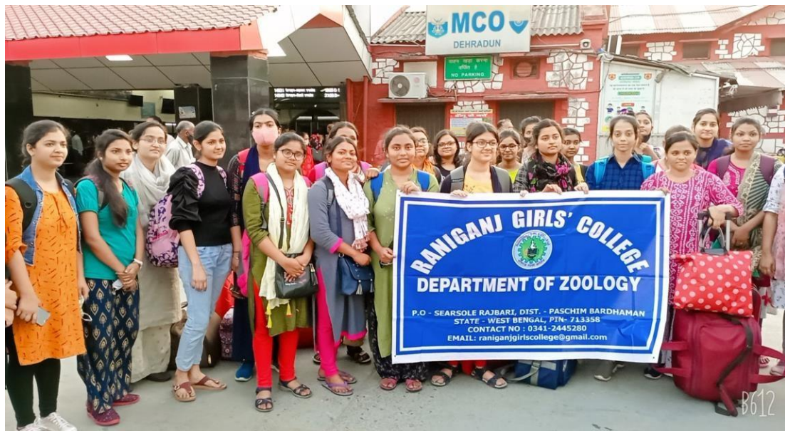
At Dehradun Railway Station