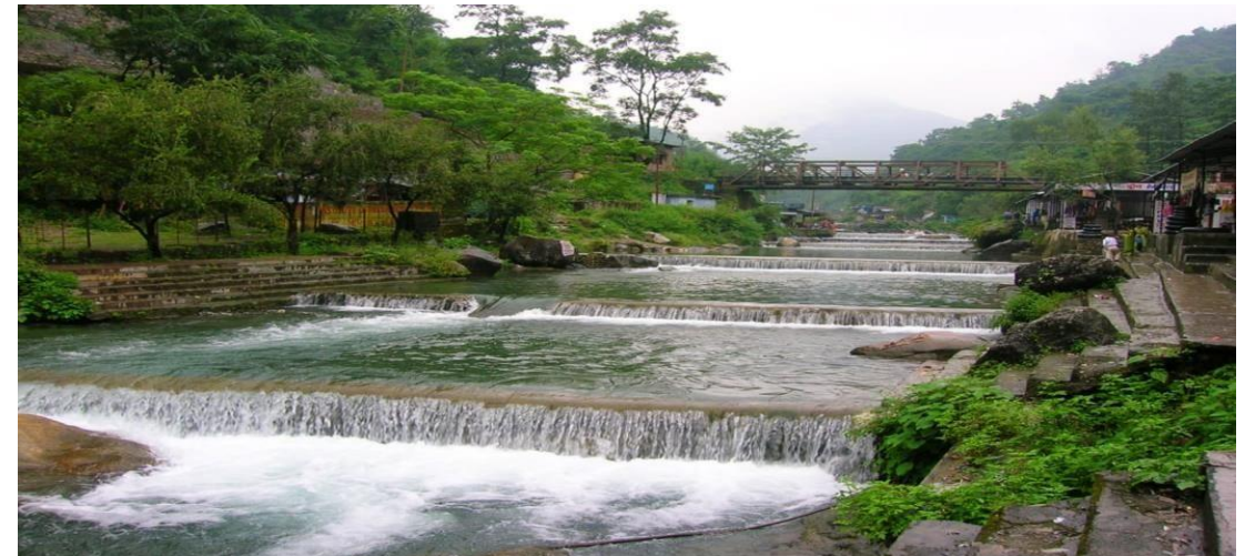
Sulphur Spring at Sahastradhara